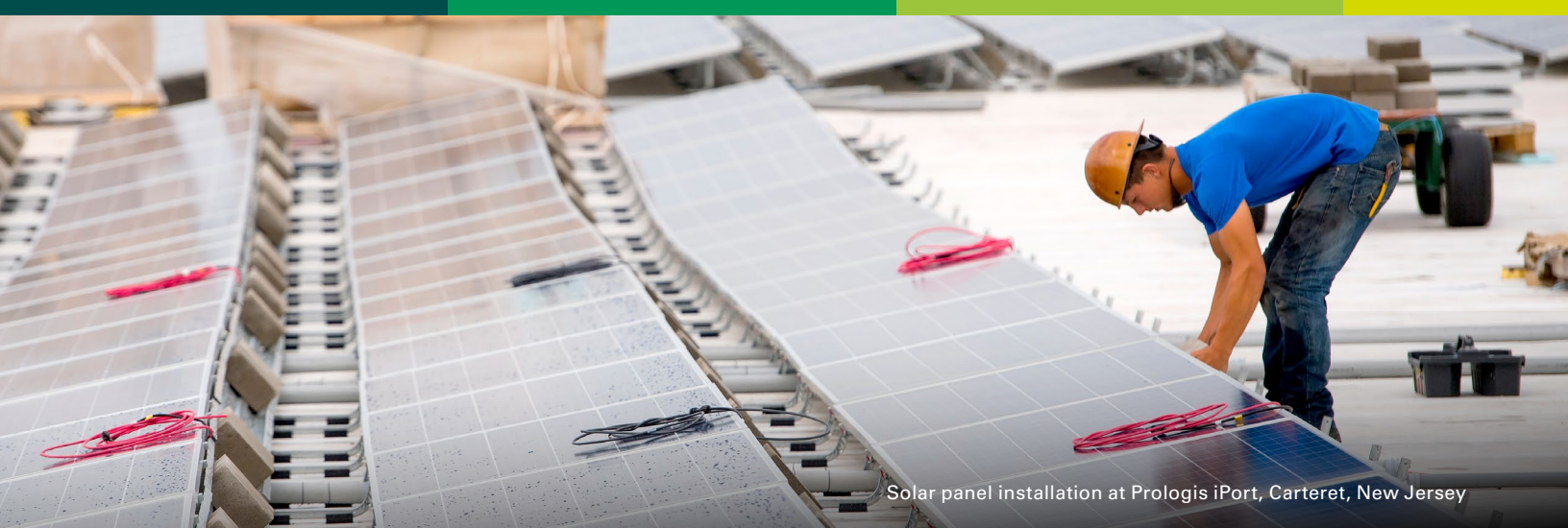
Solar panel installation at Prologis iPort, Carteret, New Jersey

Prologis is the global leader in logistics real estate. The principles of environmental stewardship, social responsibility and governance (ESG) are a natural fit in our business strategy. ESG is good business. It aligns with our longstanding commitment to be a valued partner for our customers and an exemplary citizen, minimizing our environmental impacts and maximizing returns for our stakeholders.